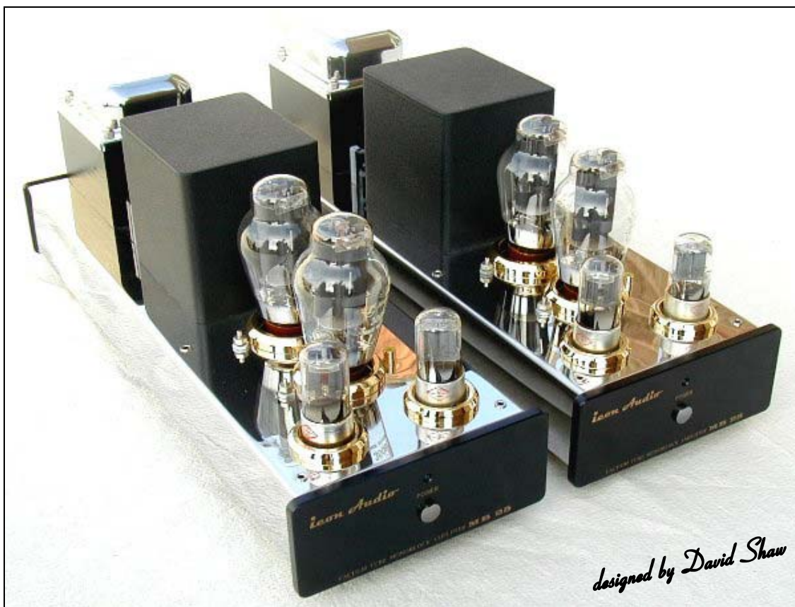
Shown here without the supplied attractive covers