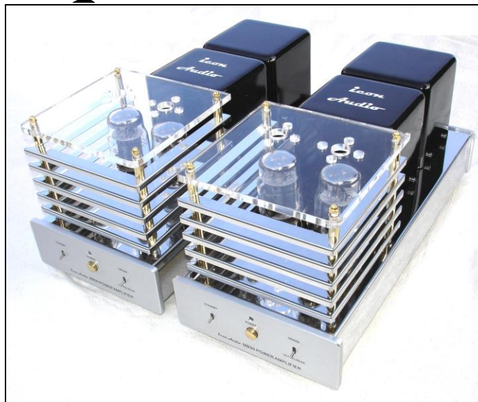
Shown with KT88 output valve

This Manual is updated to cover use with the new KT120 valve see section 7 "Valve Replacement"