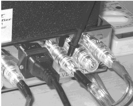
Making the 'earth' connection.

2, Connect: the black probe to the chassis 'earth' by unscrewing the '0' speaker terminal and tightening the probe in the exposed hole. And the other in the test socket adjacent to the valve on test. Set the 'Icon' meter to 2000mv or the 'black mark'. See pics.