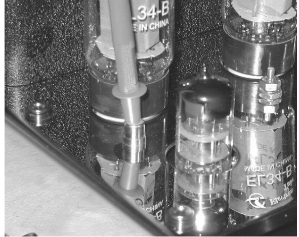
Showing a probe in output valve test point

TIP: If one or two valves are out of line with the average (e.g. 170mv) adjust those valves to the settings of the others.