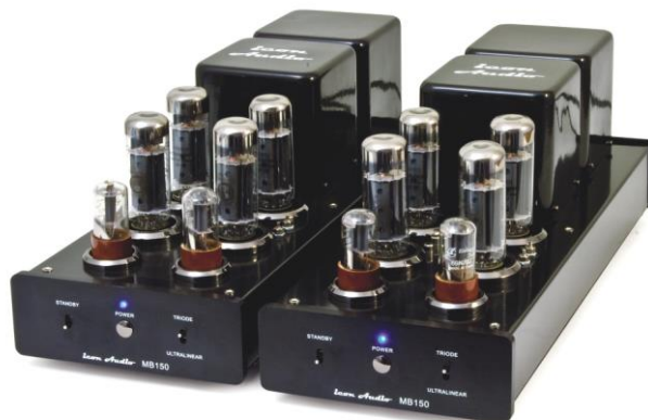
Shown with KT90 output valves

IMPORTANT! THIS MANUAL CONTAINS ESSENTIAL HEALTH & SAFETY INFORMATION FOR YOU AND YOUR AMPLIFIER. PLEASE READ & KEEP SAFE AND REFER TO IF NECESSARY