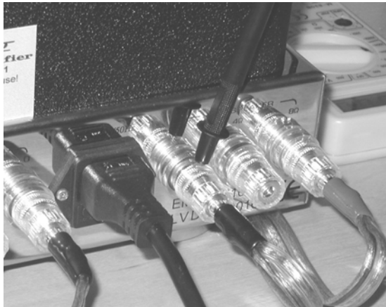
Making the 'earth' connection.

2, Connect: the black probe to the chassis 'earth' by unscrewing the '0' speaker terminal and tightening the probe in the exposed hole. And the other in the test socket adjacent to the valve on test. Set the 'Icon' meter to 2000mv or the 'black mark'. See pics.