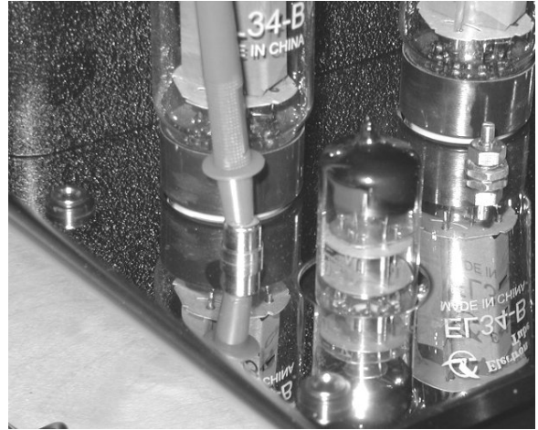
Showing a probe in output valve test point

So if all the valves are reading slightly high or slightly low, this usually means this is due to your mains. In this case no adjustment is necessary.