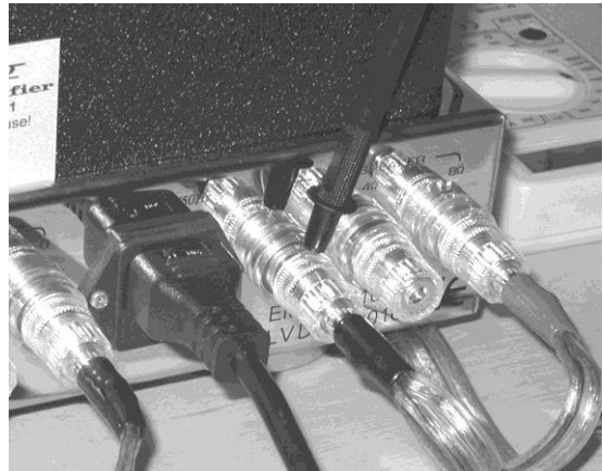
Making the 'earth' connection.

2, Connect: the black probe to the chassis 'earth' by unscrewing the '0' speaker terminal and tightening the probe in the exposed hole. And the other in the test socket adjacent to the valve on test. See pics.. Set the 'Icon' meter to 2000mv (2v) or the 'black mark'.