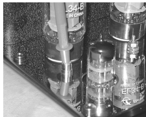
Showing a probe reading 1 st output valve

5, If one or more valves are showing erratic readings or you cannot set the correct voltage, then that valve is probably faulty or out of specification. If you are unable to set the reading high enough this means the emission of the valve is low.